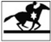
Rabbis On The Road רַבִּיבֵּי עַל הַדֶּרֶךְ

The Institute of Southern Jewish Life is pleased to announce “Rabbis on the Road,” a joint project with the Southwest Association of Reform Rabbis (SWARR) and the Southwest Council of the Union for Reform Judaism. Many congregations in the South have no rabbinic leadership, or have student rabbis or retired rabbis who travel from their homes, often in distant communities, on a semi-regular basis. Three years ago, SWARR and the Southwest Council of the URJ began to match rabbis willing to donate their time with congregations that needed their services. After a period of inactivity, the ISJL is pleased to help revive this program.