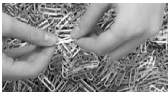
Below: Taking Sides