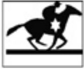
Rabbis On The Road רַבִּיבֵּי עַל הַדֶּרֶךְ

The Institute of Southern Jewish Life is pleased to announce “Rabbis on the Road,” a joint project with the Southwest Association of Reform Rabbis (SWARR) and the Southwest Council of the Union for Reform Judaism. Many congregations in the South have no rabbinic leadership, or have student rabbis or retired rabbis who travel from their homes, often in distant communities, on a semi-regular basis. Three years ago, SWARR and the Southwest Council of the URJ began to match rabbis willing to donate their time with congregations that needed their services. After a period of inactivity, the ISJL is pleased to help revive this program.