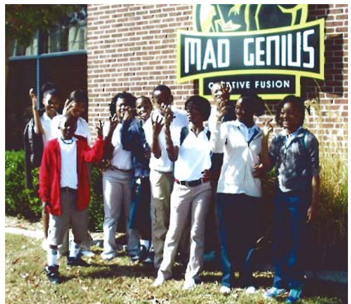
Students from Blackburn Middle School in Jackson, Mississippi, posing as “mad geniuses”

has generously supported this project by giving of their expertise, time, and resources. Together, the ISJL and Mad Genius have been working with students from Blackburn Middle School to write the script. The actors—all Blackburn/Jackson Public School students—are active peer mediators and the first students to complete a peer mediation training based on the ISJL program. The creation of this DVD will make it possible to offer the Conflict Resolution/Peer Mediation program and curriculum to more middle schools throughout our