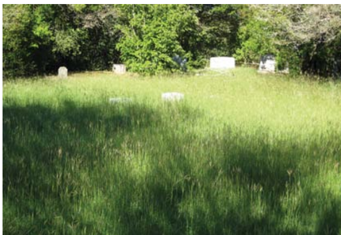
An overgrown cemetery is all that remains of the Luling Jewish community.

Today, the small Jewish cemetery north of downtown remains the only vestige of Jewish life in Luling. While Jews were among the earliest settlers in a town that seemed to hold such promise, most soon moved on to other cities and towns that offered greater economic opportunity. The few that remained set down roots and became fixtures in the local community for a large part of the 20 th century.