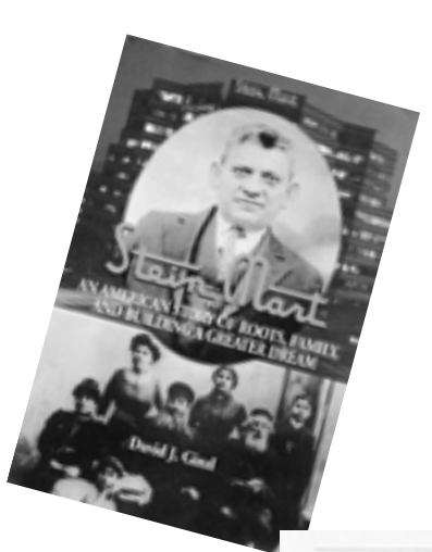
Jews in Early Mississippi